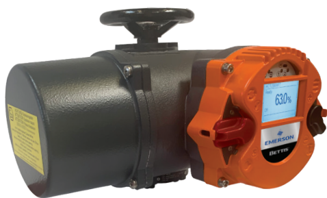
RTS Compact Quarter-Turn

The RTS Electric Actuators are built upon half a century of innovation, reliability and success in the field. These technologically advanced electric actuators are designed to increase operational safety, improve plant productivity, minimize downtime and reduce cost with a portfolio that meets the needs of control and fail-safe applications.