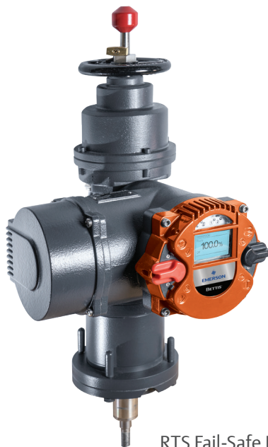
RTS Fail-Safe Linear

The RTS fail-safe product line is designed to meet challenging critical shut down requirements. The fail-safe actuators offer a range of sizes for both part-turn and linear emergency shut-down applications. The intelligent, non-intrusive platform delivers high accuracy of 0.1% for accurate positioning and adjustable speeds of the fail-safe stroke. The fail-safe action can be triggered either via loss of 24VDC signal or main power supply.