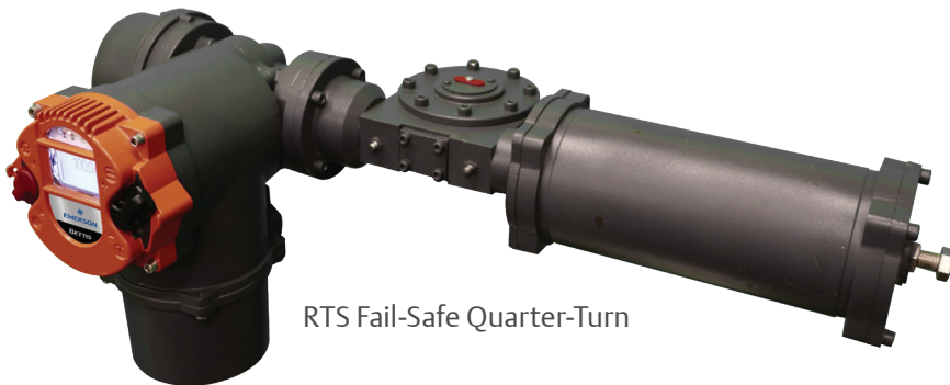
RTS Fail-Safe Quarter-Turn