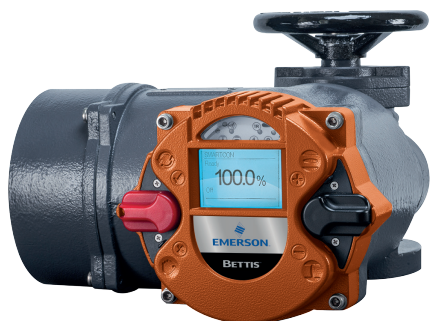
RTS Compact Multi-Turn